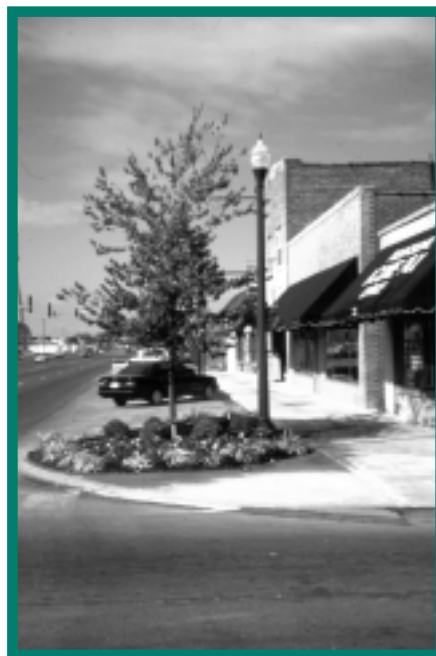
Figure 3: Broadway at 8th after TE improvements, (looking west).