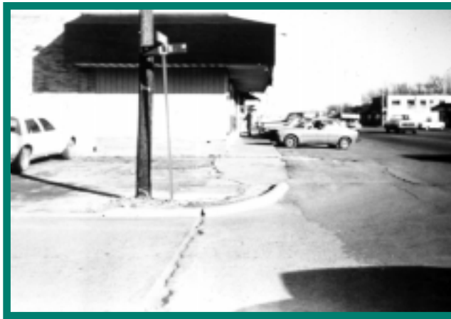
Figure 2: 800 block of Broadway before TE improvements (looking east).

By late 1996, project phases I and II were complete and the City had leveraged $105,000 for a half million dollars in capital improvements. Visible enhancement of the public streets reinforced the perception of positive change which has stimulated further reinvestment. In the project area, fifty-one retailers were open for business and