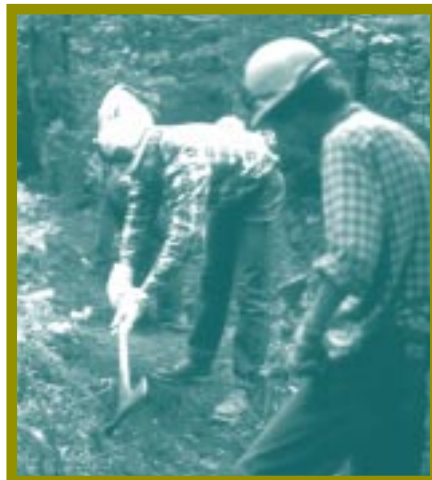
Washington Conservation Corps members performing routine trail construction

"It is really something for our crew to be proud of. For many years we will see our huge boardwalk in the middle of Ashland, and be reminded of what the WCC and dedicated young adults can do to enhance their community."