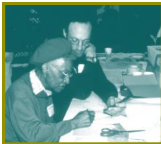
Community Design Workshop, Frederick Douglass Circle