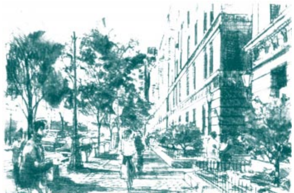
110 th Street design by Hardy Holzman Pfeiffer, Associates