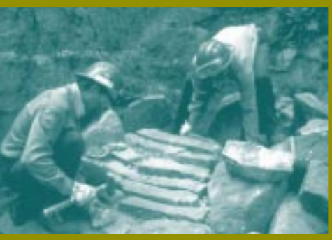
California Conservation Corps members constructing stairs in Yosemite National Park