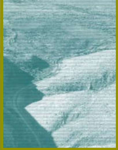
Sentenac Cienaga and Highway 78 looking west.