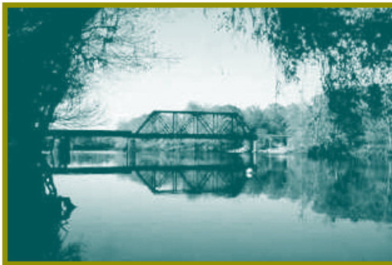
A converted rail trestle links the Nature Coast Greenway Trail over the Suwannee River.

As a result, FDOT decentralized their TE program. Mr. Crim credits this decentralization as a major factor in Florida's excellent track record with TE. Florida distributes 90-95% of their TE allocation to FDOT's seven district offices based on legislated formulas, and sets aside the remaining five to ten percent for projects of statewide or regional interest that are sponsored by state or federal agencies. All project applications for local projects are reviewed and implemented through FDOT's district offices, while only the applications for statewide TE funds are reviewed by the central FDOT office. The district offices report all of their TE project spending in FDOT's centralized Financial Man-