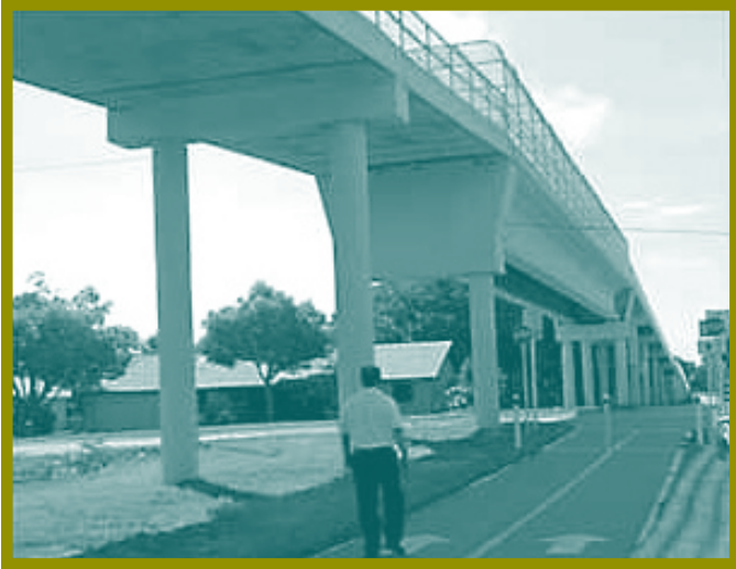
Pinellas Trail Overpass provides a safe bicycle and pedestrian crossing over 113th Street.

To become LAP certified, a local agency must first request LAP status and then go through a thorough review process. In District One, FDOT staff form a team of its office managers who interview potential local agency staff in peer positions, to determine the local staff's expertise in engineering, environmental review, right-of-way, finance, contracts, design, surveying, and more. Once the interviews are complete, FDOT District One staff submit a recommendation for LAP status to the District Secretary for approval. In District One, every local agency that has requested LAP status has received it.