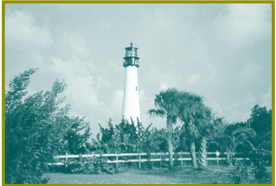
The restoration of Cape Florida Lighthouse in the Bill Baggs State Recreation Area was one of the first TE projects in Florida.