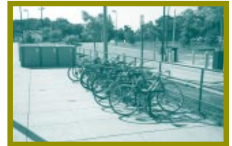
Trail commuters fill the bike racks at the West Hyattsville Metro station

At the heart of the "Y" where the two branches come together is the fourth Metro station, which is adjacent to the trail. In order to meet one