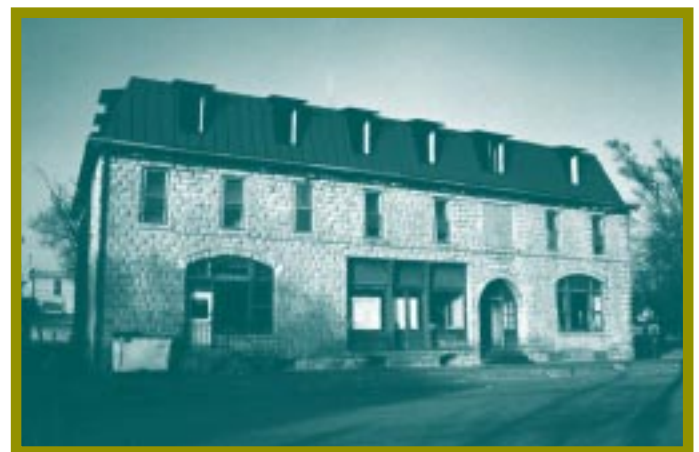
The Midland Hotel