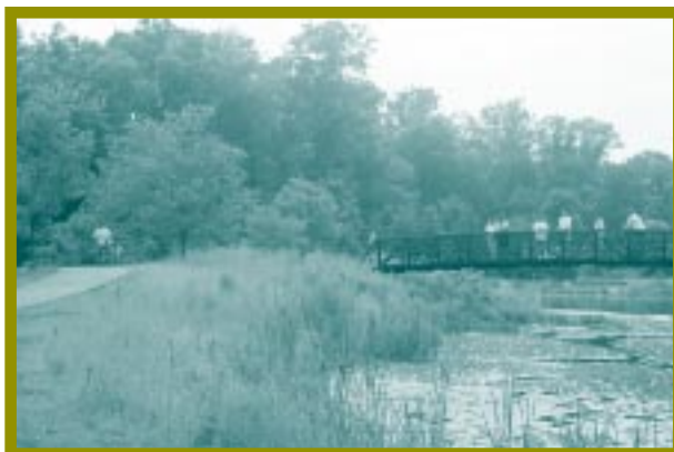
Roller bladers, bicyclists, and pedestrians enjoy the trail's access to Lake Artemesia.

The Anacostia Headwaters Greenway Task Force led the charge for this TE project. Three keys steps taken by the Task Force set the stage for rapid project approval when it was ultimately presented to the Maryland Department of Transportation (MDOT).