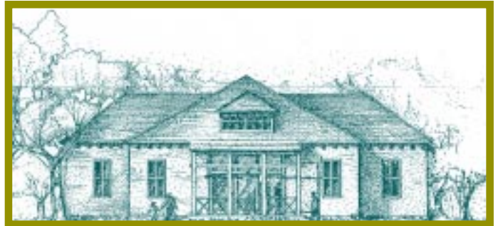
The Irvington Steamboat Museum

In some cases, facilitating education and enhancing the transportation experience requires a structure. The town of Irvington, VA, part of the Tidewater Region, is preserving the area’s steamboat history through the creation of a “Steamboat Era Museum” with the help of $220,000 in TE funds and a $130,000 local match. Construction is to begin