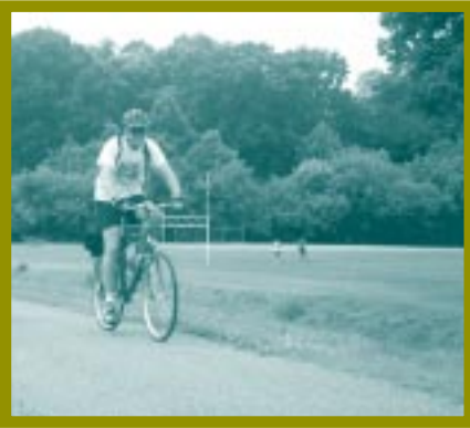
People can use the trail to get to local parks and athletic fields.

First, the Task Force formed a partnership with the M-NCPPC. Although the concept for a system of trails had been on the county's master plans since 1975, only short, unpaved sections existed. M-NCPPC agreed to sponsor the project by allowing the use of the right-of-way and taking over long-term maintenance of the trail. Having the right-of-way already under the ownership of a public agency did help speed up the approval process.