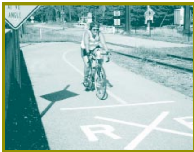
The Schuylkill River Trail turns perpendicular to the tracks at the crossing.