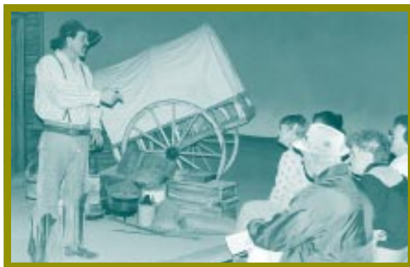
Costumed actors guide visitors through the Oregon Trail experience at the National Oregon/California Trail Center.

FOR A FREE COPY OF COMMUNITIES BENEFIT! CALL NTEC AT 888-388-NTEC, OR EMAIL NTEC@TRANSACT.ORG. THE BOOKLET CAN ALSO BE VIEWED AND PRINTED FROM NTEC'S WEB SITE AT WWW.ENHANCEMENTS.ORG.