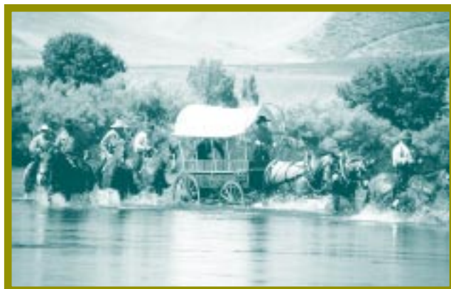
A re-enactment of the Snake River Crossing at Three Island State Park.

A partnership between Idaho Department of Parks and Recreation and the Idaho Transportation Department (ITD) made the interpretive center a reality.