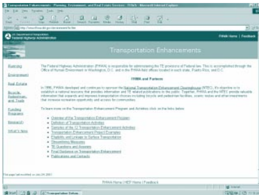
To access a variety of FHWA TE-related information visit: www.fhwa.dot.gov/environment/te.htm .

For more information on these Q & A’s, visit NTEC at www.enhancements.org . Contact your FHWA Division Office TE contact, or the FHWA Washington Office Program Manager. Your State TE Coordinator can provide you with state specific information; their contact information can be found on the NTEC Web site or by contacting NTEC at ntec@transact.org or 1-888-388-6832.