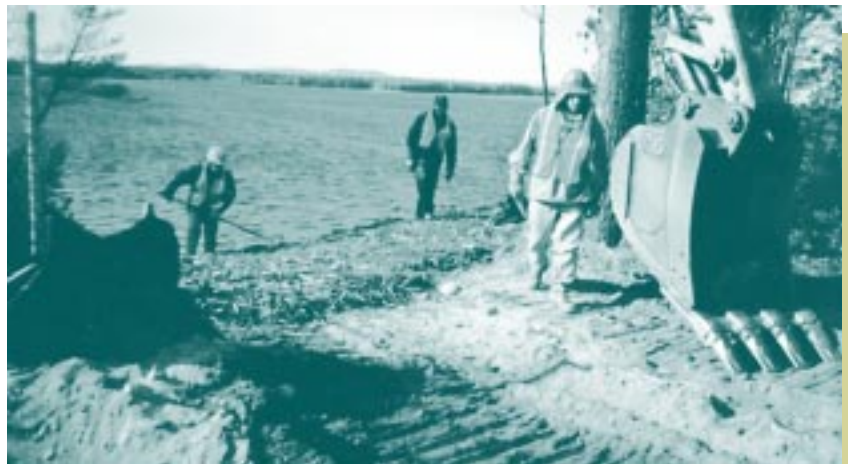
Sebago Lake — Route 35 highway runoff project in Standish, Maine.

For further information on the program in Maine contact Susan Breau at 207-624-3080.