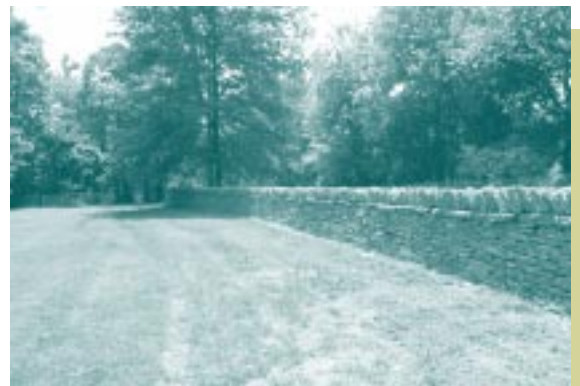
Historic dry-laid stone fence along Paris Pike in Kentucky.