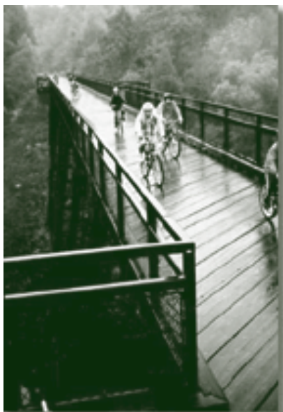
Dramatic views from Breeden Trestle along the Tunnel Hill State Trail.

To learn more about this trail project contact Todd Hill at hilltw@nt.dot.state.il.us .