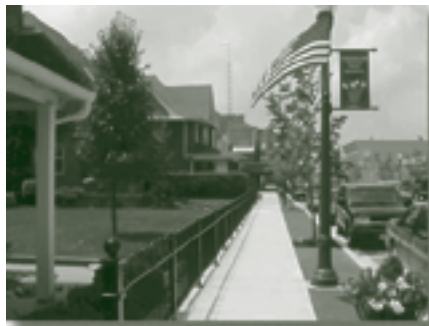
TE project in the Village of Versailles, Ohio.